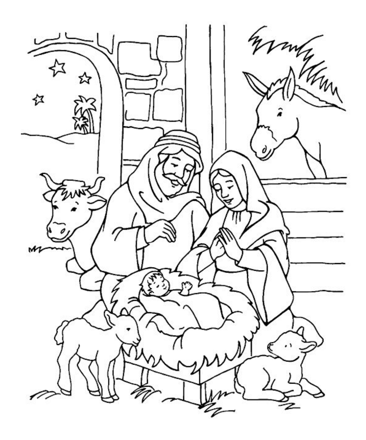
Tell me about baby Jesus.

Read more about this week's story in the book of Luke 1-2.