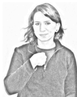
ME (point to self)