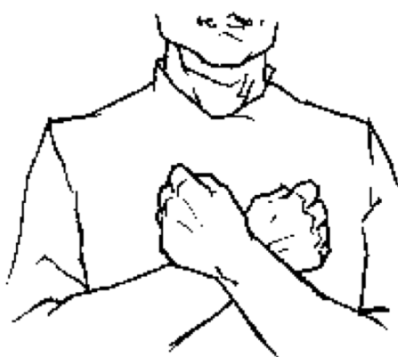
LOVES (cross arms over chest)