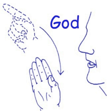
GOD (point up and then draw hand down while pushing other fingers in same direction)